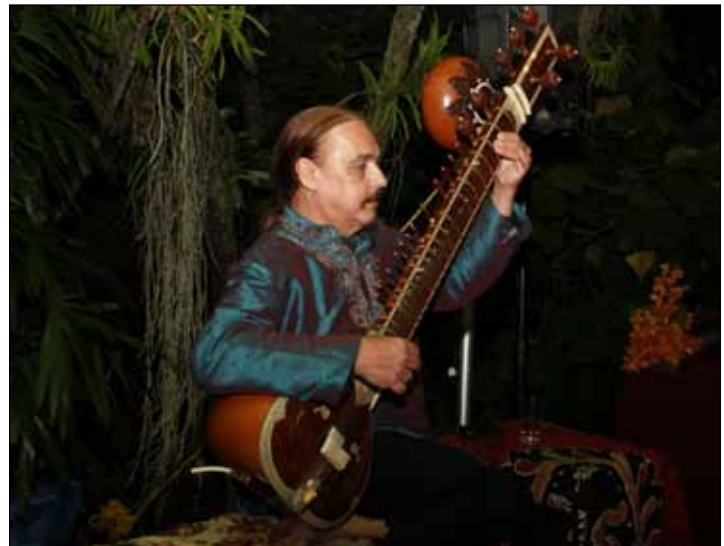
A sitarist entertains guests to the sounds of Indian music.