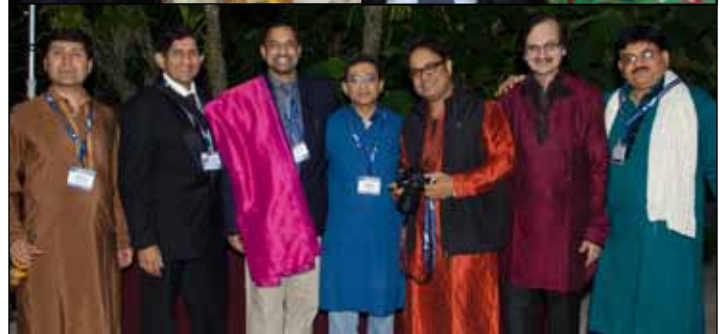
ISD members were all smiles spending time with their colleagues.