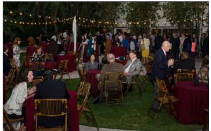
Guests enjoy the festive and lush atmosphere of the Miami Beach Botanic Gardens.