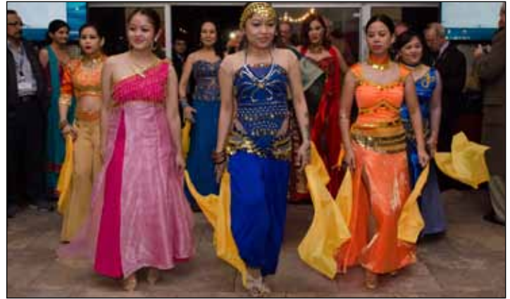
Dermatology residents and consultants from the Philippines perform a traditional Indian dance.

Next year's AAD Annual Meeting will be in Denver, Colorado, in March 2014, so plan to attend the next annual ISD reception. It's sure to be another not-to-be-missed gathering of ISD friends from all corners of the world!